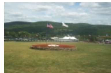
Cooperstown Dream Park